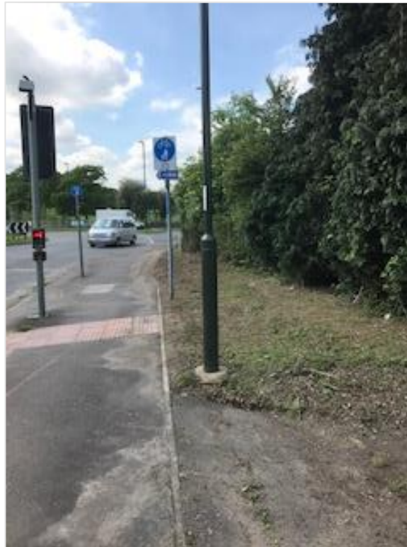
Radford Road AFTER