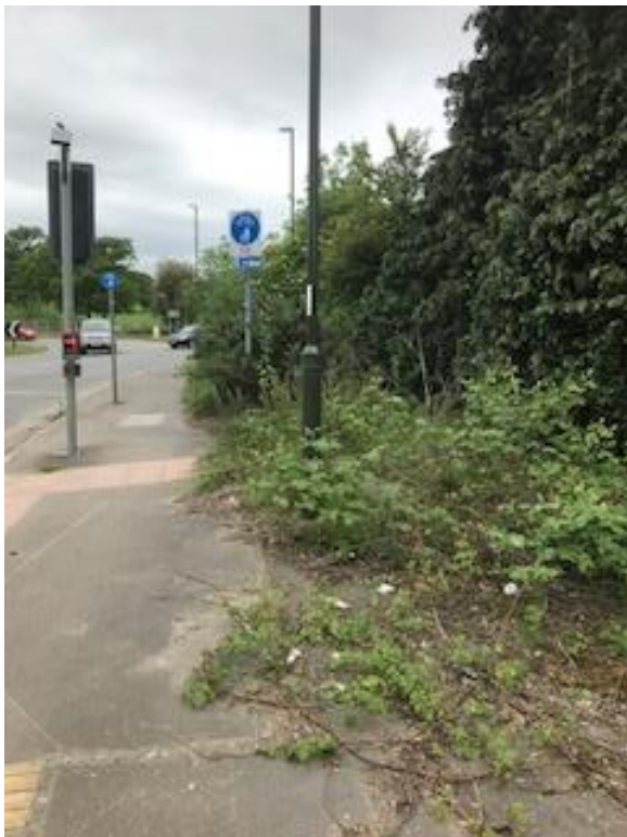
Radford Road BEFORE

One and half ton of green waste was removed from both Rutherford way and Radford Road. Half a ton of refuse waste was removed from the areas in question.