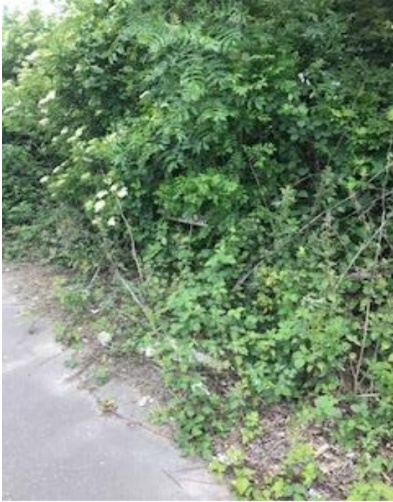
Radford Road BEFORE