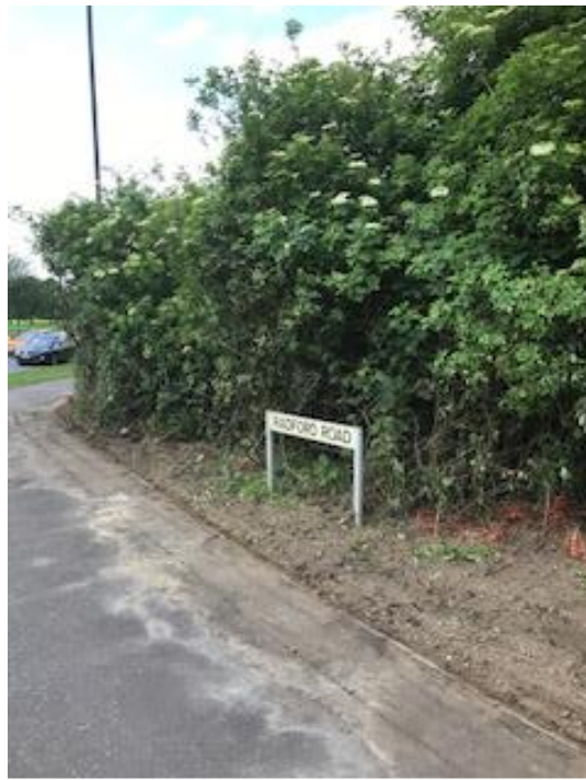
Radford Road AFTER

Compliments have been received by staff from surrounding businesses. One comment was that it is nice to see the attention to the area and it's starting to look more aesthetically pleasing.